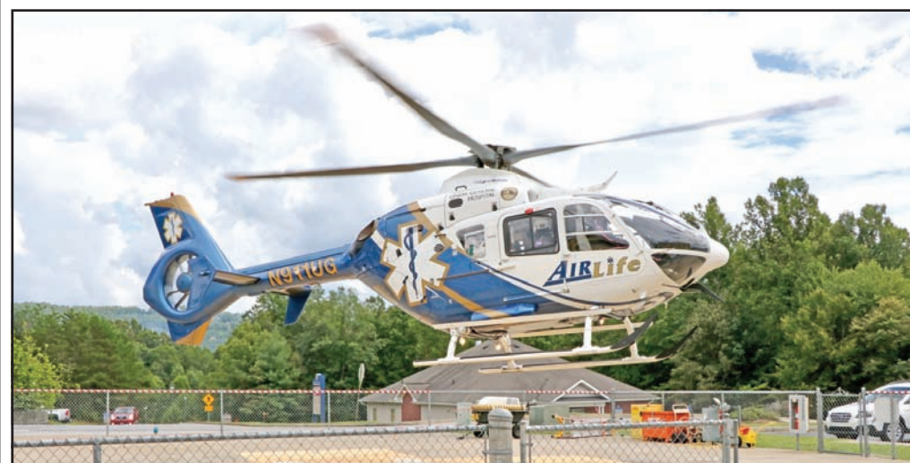
Meet Air Life 14, the new twin-engine Eurocopter EC-135 based at Union General Hospital in Blairsville.