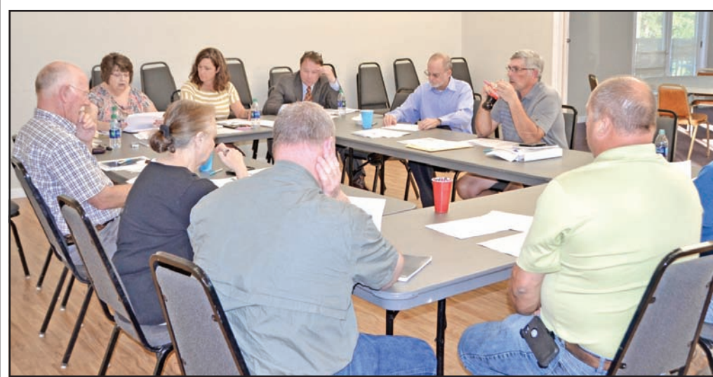
Officials with the City of Young Harris holding a public budget hearing on Tuesday, Sept. 18, at city hall.